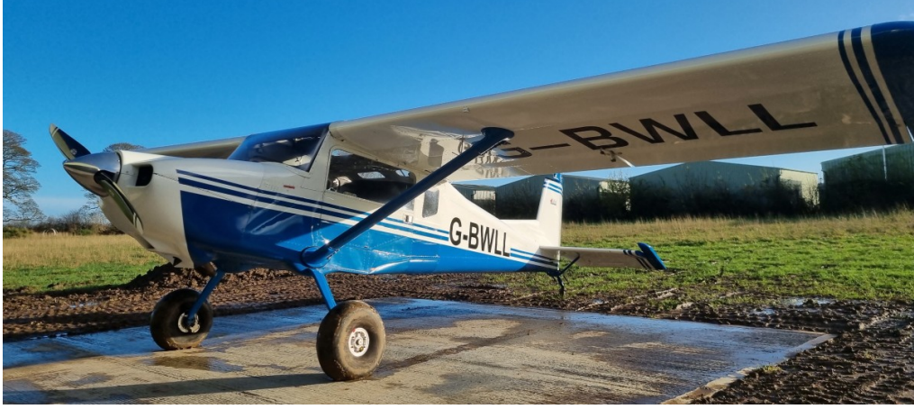
G-BWLL Murphy Rebel