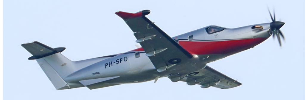
PH-SFG Pilatus PC XII 04/11 Paul Whincup