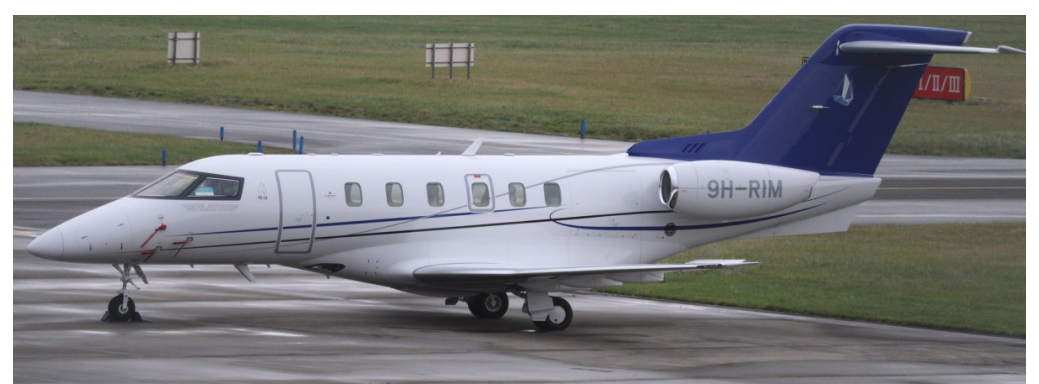
9H-RIM Pilatus PC-24 24/11 Ian Gratton

Cessna 525B CJ3 OE-GRA arr 09:30 dep 15:35, Beech 200C Kingair G-NIAB arr 10:13 dep 12:41, Cessna 560 Excel G-NJAC arr 11:55 dep 15:06, Global Express C-GLXM dep 13:11, Pilatus PC-24 9H-RIM dep 17:48