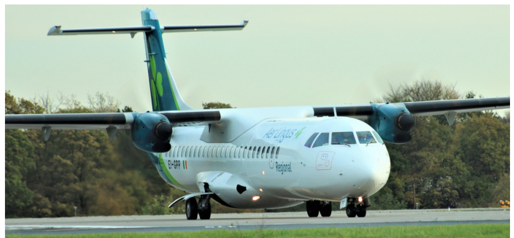
EI-GPP ATR72-600 Emerald 02/11