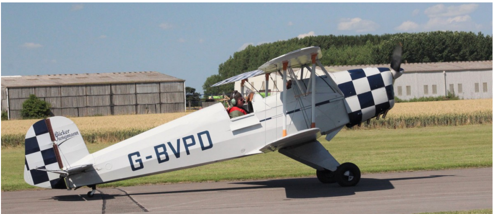
G-BVPD Bucker Jungmann CASA 1131E