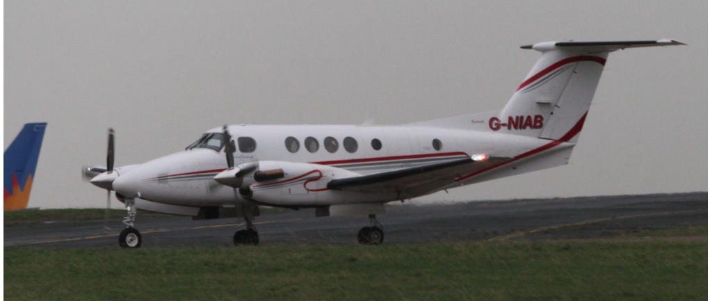
Beech 200C Kingair G-NIAB Woodgate 24/11 Ian Gratton

Partnavia P68 G-POLW dep 14:09 ret at 16:33, Cessna 560 Excel D-CDCM arr 14:22 dep 15:05,