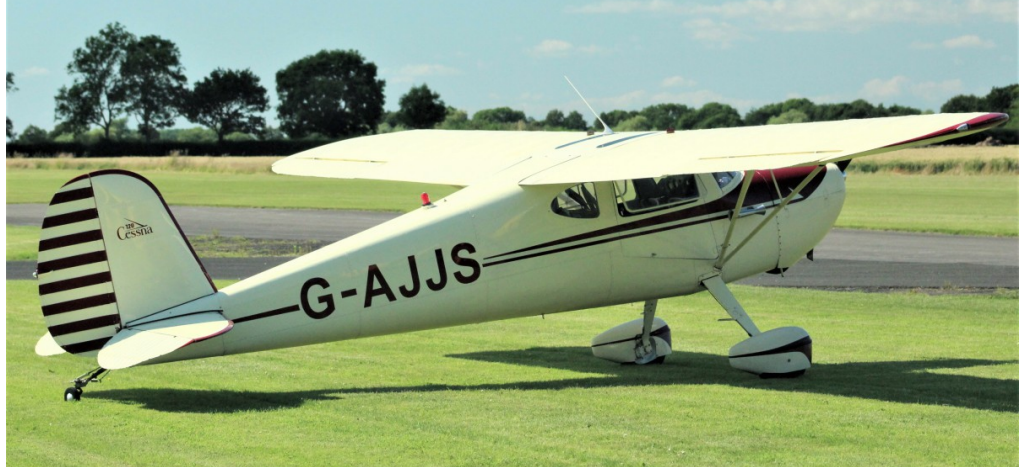
G-AJJS Cessna 120