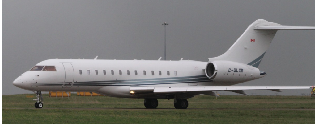
C-GLXM Global Express 24/11 Ian Gratton