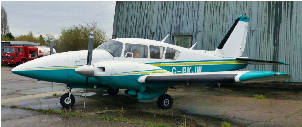
G-BKJW PA23 Aztec 05/11