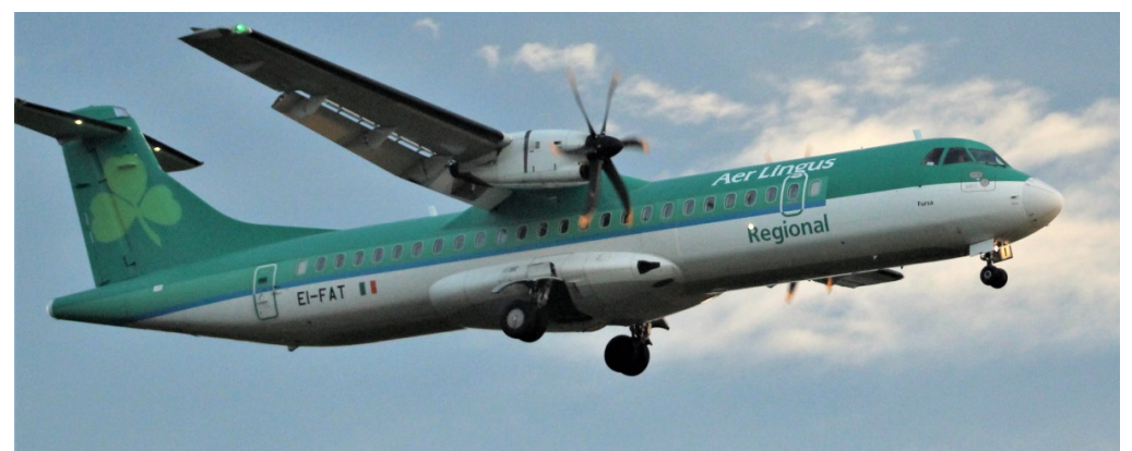
EI-FAT ATR72-700 Emerald 02/11