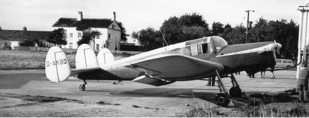
G-AKBO Miles Messenger Sherburn c 1960's