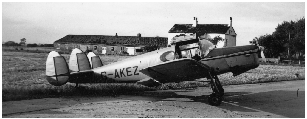
G-AKEZ Miles messenger Sherburn c 1960's