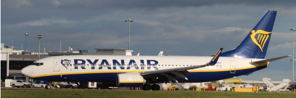
SP-RSY Boeing 737-8WL 04/11 Ian Gratton

Krakow(2333/2332, "8BA/96YF", Mon):-7/11 SP-RZD, 21/11 SP-RZM, 29/11 SP-RKS(2333). Poznan(7944/7945, "269Q/339M", Fri/Sun):-4/11 SP-RSY, 6/11 SP-RSY, 11/11 SP-RKG, 13/11 SP-RSY, 18/11 SP-RSZ, 20/11 SP-RSU, 25/11 SP-RKG, 27/11 SP-RSZ, 28/11 SP-RSA(7945). Warsaw(1932/1933, "749M/1933", Mon):-7/11 SP-RZG, 21/11 SP-RZD, 28/11 SP-RZD. Other flights:-6/11 SP-RKI(32P) positioned in from Manchester, 15/11 SP-RZF(320P) positioned in from Manchester, 28/11 SP-RSA(71P) positioned in from Liverpool, 29/11 SP-RKS(030P) positioned out to Wroclaw.