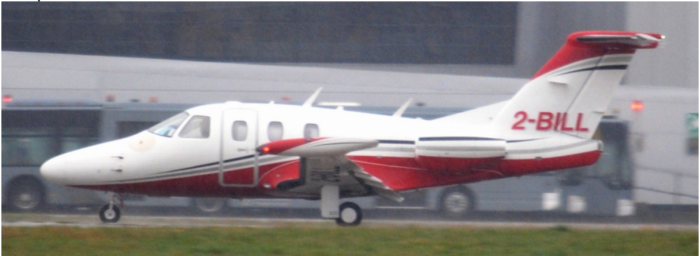
2-BILL Eclipse Ea500 18/11 David Wooler

Eclipse Ea500 2-BILL arr 08:29 dep 10:19, Cirrus Sr22 N575PW arr 10:14 n/stop, Phenom 300 G-VUYK arr 12:13 dep 12:52, Eurocopter EC145 (really MBB BK117) G-TAJB arr 13:43 dep 15:18, Beech 200C Kingair G-NIAB arr 13:49 dep 14:08, Cessna 550 Bravo G-IPLY arr 17:59 n/stop.