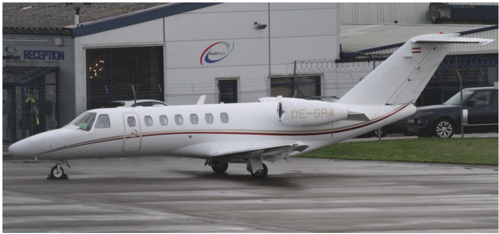
Cessna 525B CJ3 OE-GRA 24/11 Ian Gratton

Monday 28<sup>th</sup> November Pilatus PC XII M-OLTT dep 12:17