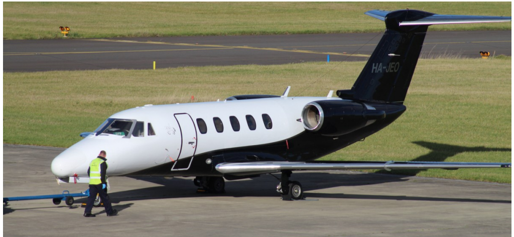
HA-JEO Cessna 650 Citation III 04/11 Ian Gratton

Dassault Falcon 8X 3A-MGA arr 09:48 dep 10:19 ret LBA at 14:49 n/stop, VAN's RV-6 G-BZVN arr 11:26 dep 14:57, Dassault Falcon 50EX <u>M-ODUS</u> arr 11:35 n/stop, Cirrus SR22 N220AD dep 12;15, Cessna 525B CJ3 D-CGER dep 13:02, Cessna 560 Excel CS-DXS arr 16:45 n/stop, Learjet 60 D-CFAZ arr 16:54 dep 19:30, PA-28-140 Cherokee G-LFSI arr 17:02 n/stop, Cessna 525A CJ1 D-IQQQ arr 18:30 n/stop