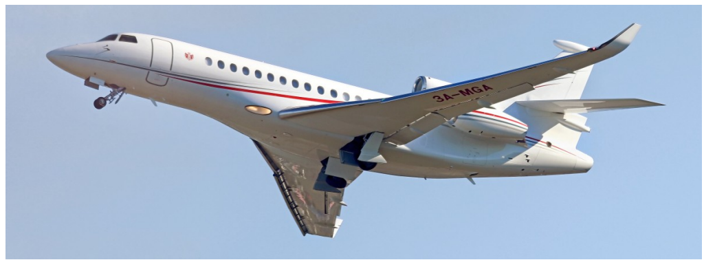
3A-MGA Dassault Falcon 8X 04/11 Paul Whincup