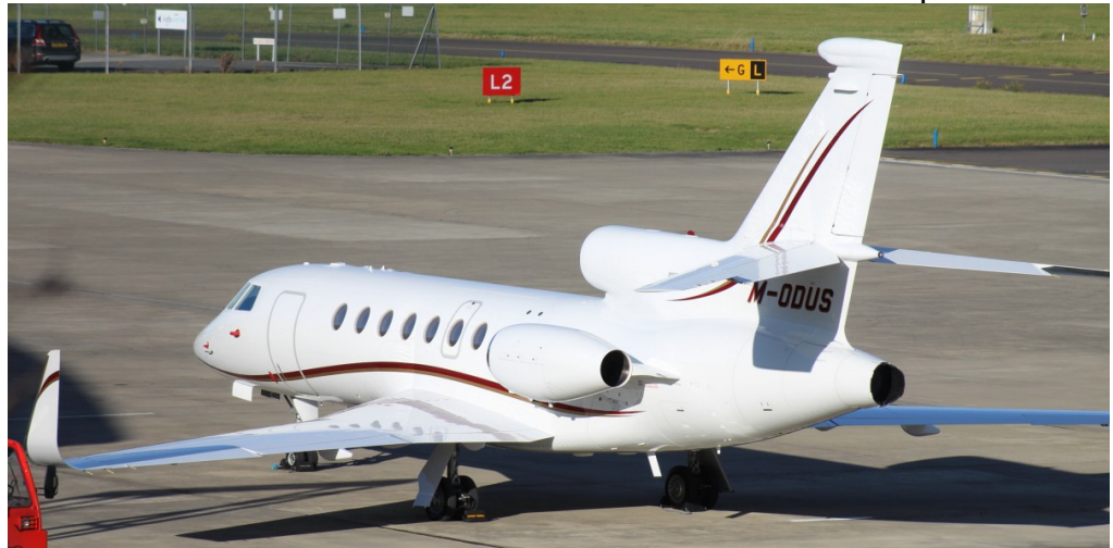
M-ODUS Dassault Falcon 50EX 04/11 Ian Gratton