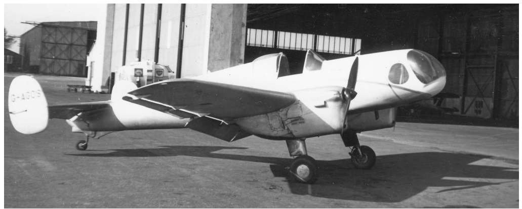
G-AGOS RSA Desford visiting Yeadon 1960's