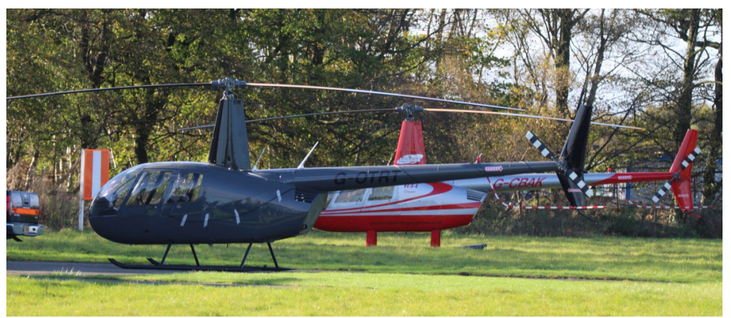
G-OTRT/G-CBAK Robinson R44 Ian 4/11 Gratton